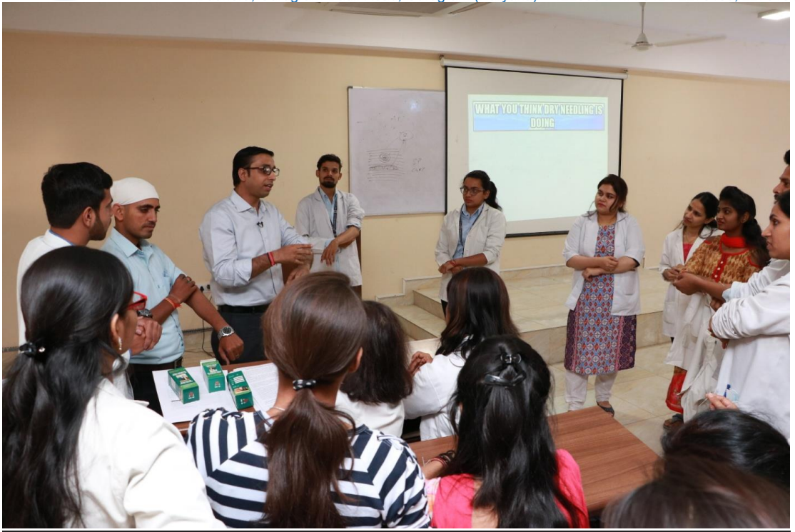
Figure: 4 Resource Person Explaining the Concept of Dry Needling

Budhera, Gurugram-Badli Road, Gurugram (Haryana) – 122505 Ph.: 0124-2278183, 2278184, 2278185