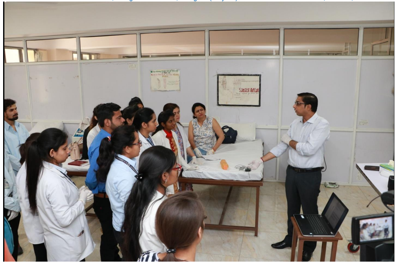
Figure:3 Resource Person Explaining the Procedure of Dry Needling